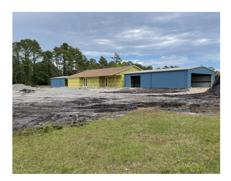
Roofs are up on the new clubhouse and cart barns, interior work is underway, and the new parking lot is taking shape.

New weekend and holiday rates are now in effect for member cart fees and public greens fees/cart fees