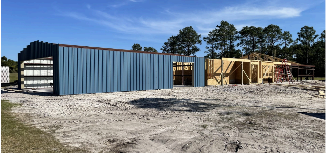
Significant progress has been made in the last month on the structures of the new clubhouse and cart barns.